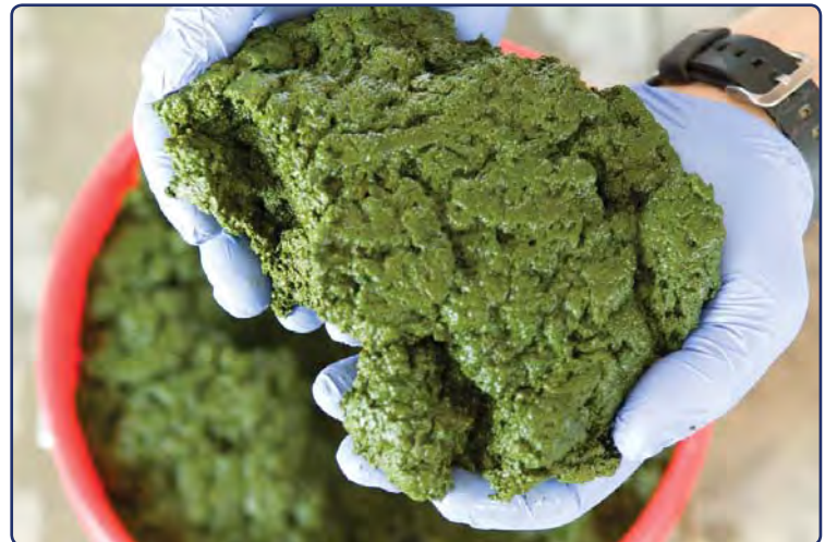
Dry Algae, Separation Process