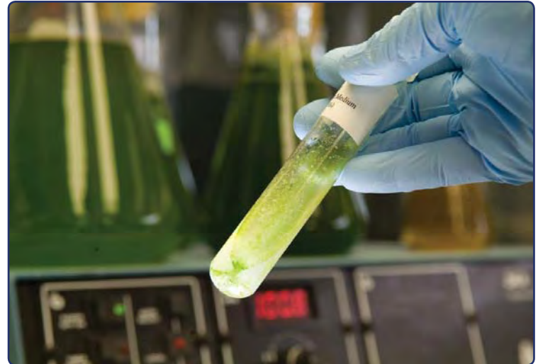
Algae Testing, Propagation Lab

For high-resolution photos, interviews, videos, and additional information on the AgriLife Research Bioenergy Program or General Atomics, visit algaeorfuel.agrilife.org