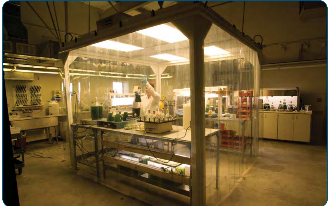
Algae Clean Room

“TOGETHER, THESE ORGANIZATIONS HAVE BUILT A TEAM OF THE MOST ADVANCED INDUSTRY, UNIVERSITY, NATIONAL LABORATORY, AND GOVERNMENT PARTNERS WORKING ON DEVELOPMENT OF THIS TECHNOLOGY.”