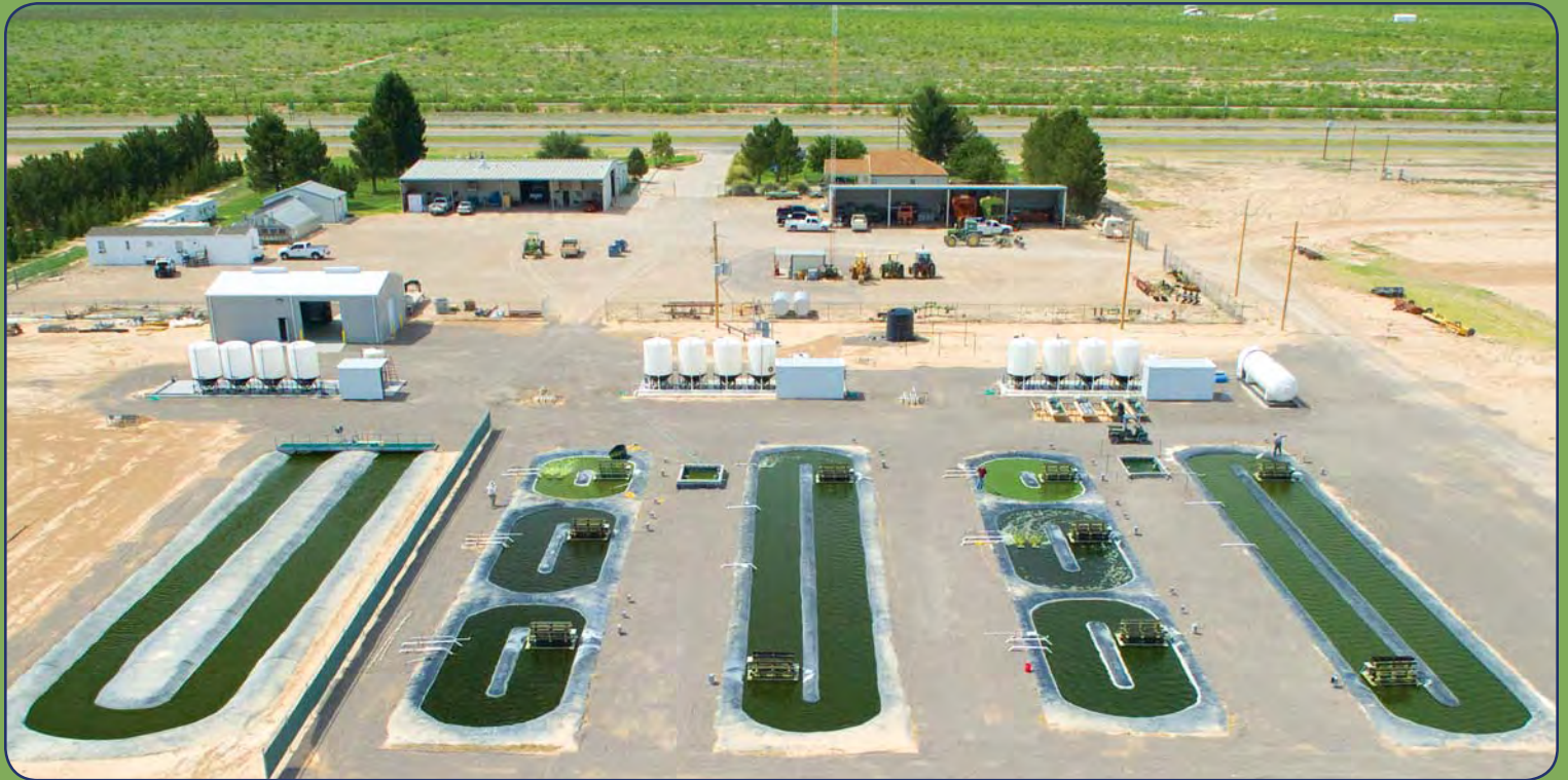
Microalgae Raceways and Cone Bottom Tanks, Pecos Algae Research and Development Facility