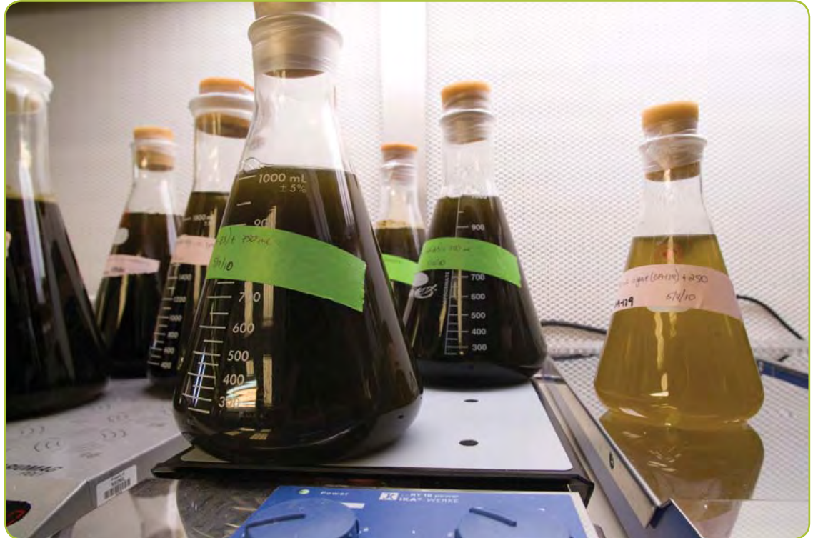
Algae Samples for Testing

Throughout its history, GA has been recognized for its ability to meet major multidisciplinary technical challenges, resulting in world-class, first-of-a-kind equipment for critical energy and defense requirements. With more than 5,000 employees, GA