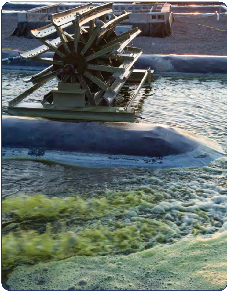
Paddlewheels in Raceways

from wastewater treatment facilities, using a combination of algae and microorganisms, for applications throughout the world.